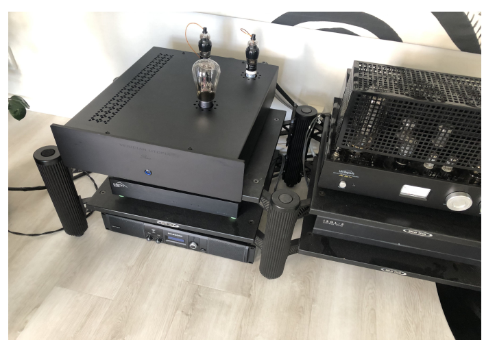
My first Sirus DAC!

I have been a real DAC-O-MANIAC the last couple of years . After purchasing and evaluating a number of great sounding DACs (for instance, Lampizator Level 6, Metrum Pavane Mk3, Sonnet Audio Morpheus) and a number of other DACs using off the shelf DAC chips, I came to the conclusion that: I prefer a DAC using NOS (Non-Oversampling) R2R converter type over any DAC with Delta Sigma converter type. It just feels more natural and musical! I also like very much what tubes in the output stage adds to the experience, hard to define, but it just brings a bit of "magic" to the sound. So, with that in mind, I decided that I will not purchase any more DACs unless they have both of those ingredients.