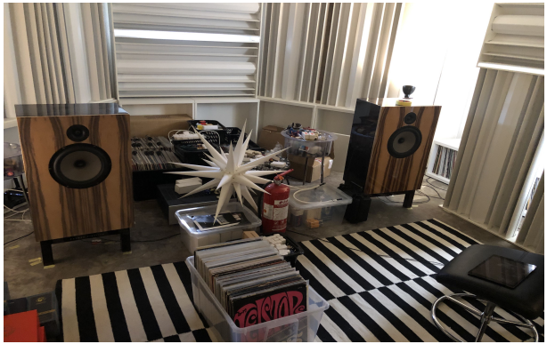
My friends rig, with interesting sound treatment, including a fire extinguisher!

My friend having the Lampizaor level 7 visited me and was very impressed. He suggested that we do a DAC Shootout (comparison) at his home with his gear .So, we did, listening to his great setup with DeVore 96 Orangutan Speakers, Air Tight ATM-S1 amplifer, SOTM streaming via ROON. Both DACs were using their built in resistor ladder typ volume controls. We were 3 Hifi pals in the room, and after listening to both DACs, the comments on the Sirus DAC were "it is very very similar, it has the same PRAT as the Lampi, it has great bass definition, wow, it has more quite background "etc. We listened for several hours, and both DACs offered a very lifelike and musical expereince. My feeling was that the Lampi had a slight edge in "magic" probably by using the 300B tubes in the output stage. But the difference was subtle, and with the cost difference in mind, I actually did not care.